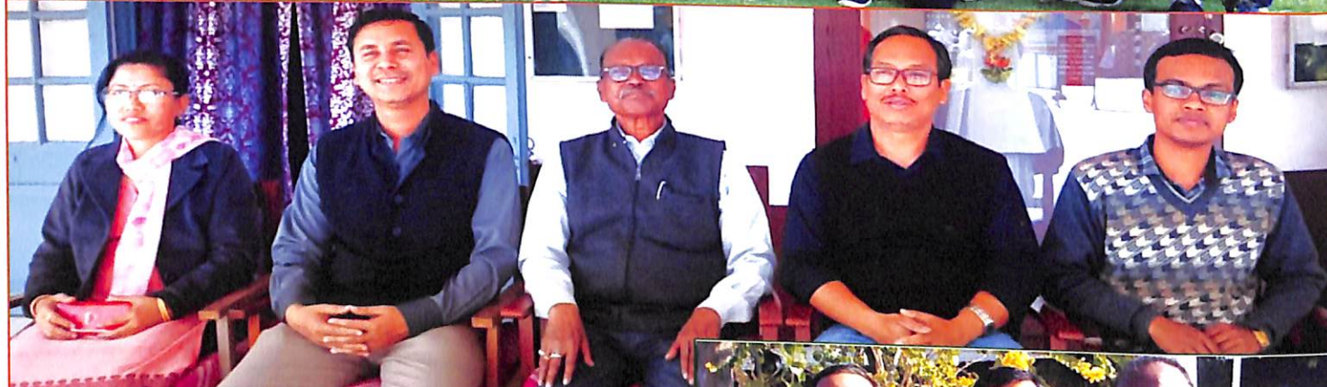
Teachers of the Department as on 15/02/2019