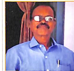
Sir Titus Bhengra