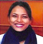
The Ideal Editor