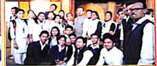
Students' Exposure Visit to State Legislative Assembly