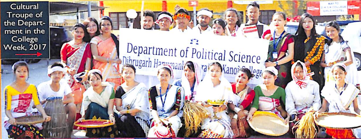
Cultural Troupe of the Department in the College Week, 2017