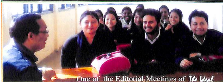
One of the Editorial Meetings of The Ideal