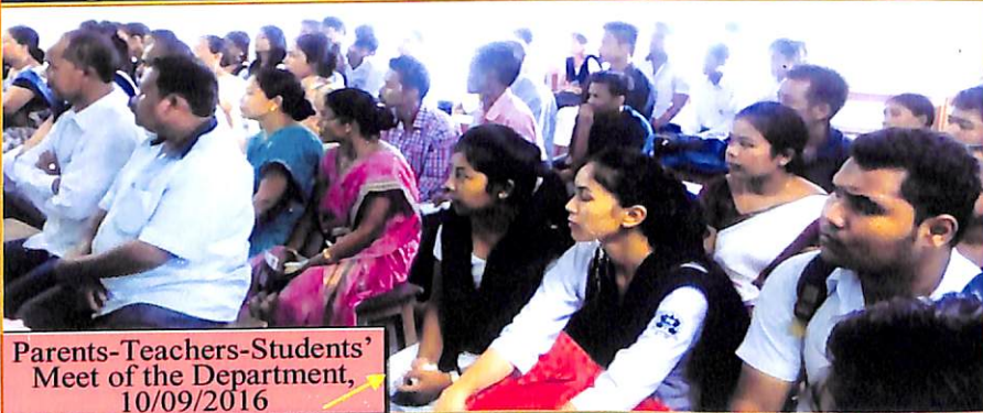
Parents-Teachers-Students' Meet of the Department, 10/09/2016

THE SIGN OF A BEAUTIFUL PERSON IS THAT THEY ALWAYS SEE BEAUTY IN OTHERS.