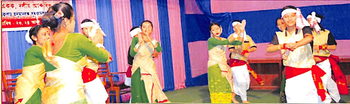
Our girls dancing Bihu Dance & won the First Prize in the Competition during College Week, 2017

THE SIGN OF A BEAUTIFUL PERSON IS THAT THEY ALWAYS SEE BEAUTY IN OTHERS.