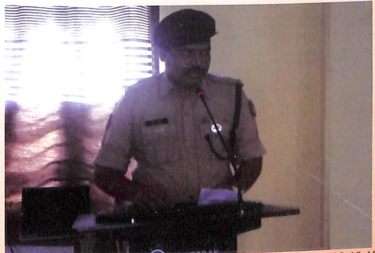
Career Counseling by CRPF (Central Reserve Police Force) 08.10.18