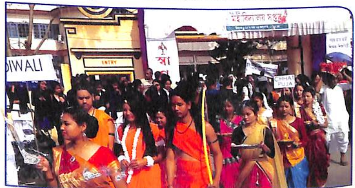
Cultural Procession, College Week, 2018