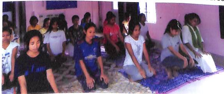
Celebration of International Yoga Day, Girls' Hostel