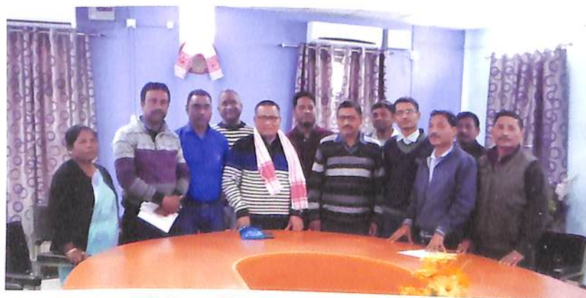
College Office Staff meet on 03.12.18