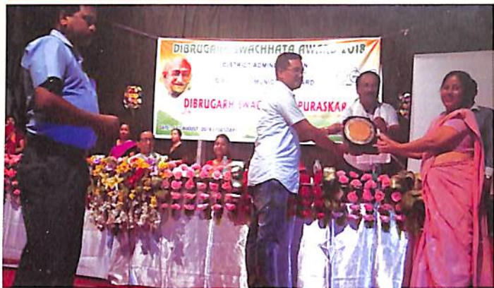
DHSK College secured the 3rd position in the Dibrugarh Swachhata Puraskar-2018 declared by District Administration and Dibrugarh Municipal Board on 14.08.2018