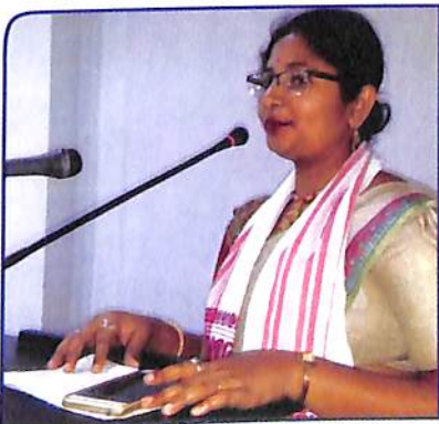
International Womens Day, jointly observed by DU women study Centre and DHSK College ACTA WOMEN CELL 08.03.18