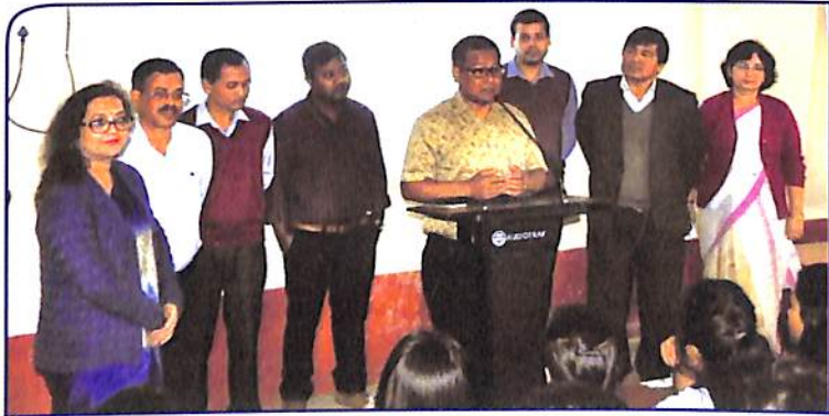
National Science Day, 28.02.2018