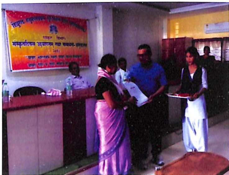
Sanskrit Divas celebrated on 27.08.2018