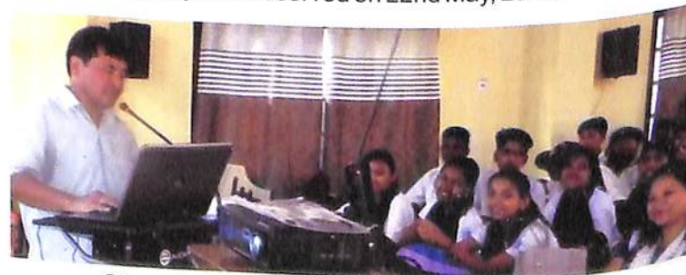
Observing World Bio-diversity Day, 22.05.2018

a. The Orientation Programme for Assam Biodiversity Portal, for Ashoka Trust for Research and Environment (ATREE) in collaboration with Nature Interpretation Centre, DHSK College was organised on 26th March, 2018. b. World Bio-diversity Day was observed on 22nd May, 2018.