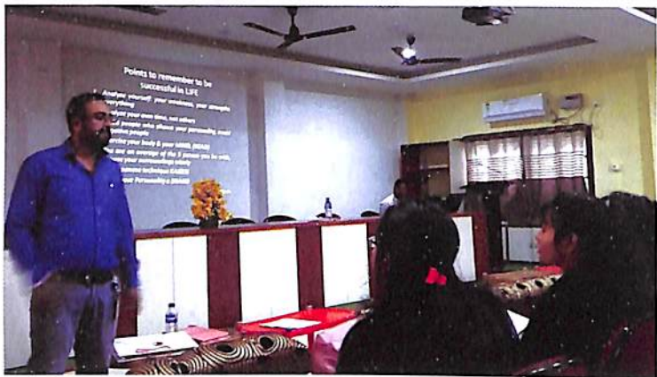
Motivational Talk organised by Moral Education Centre on 26.02.2018