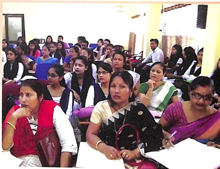
Parents meet Organised by dept. of Political Science, 31.03.18