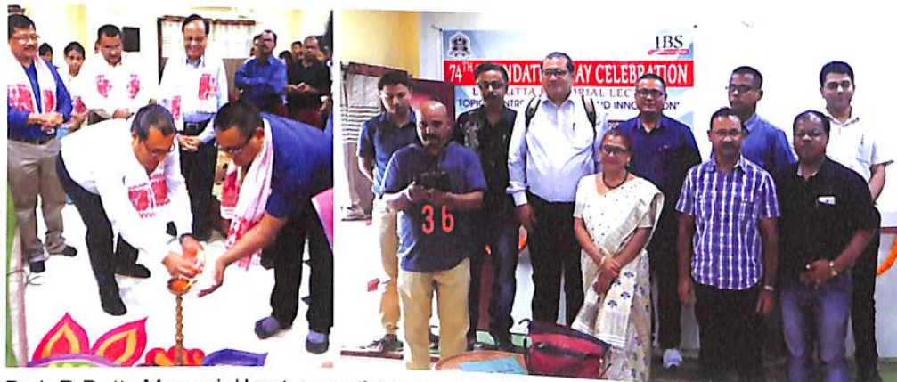
Dr. L.P. Dutta Memorial Lecture on the occasion of College Foundation Day, 15.06.2019