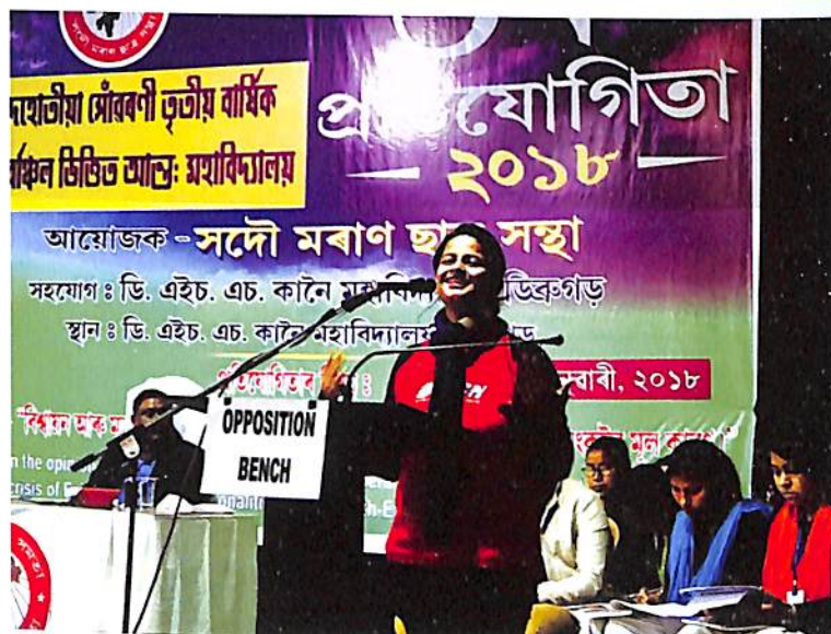
North-East debating competition on 23.01.18