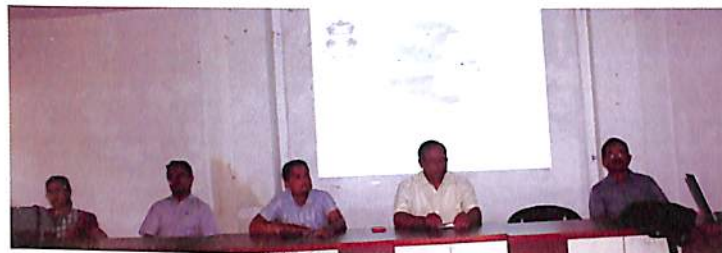
World Ozone Day, 04.10.2018