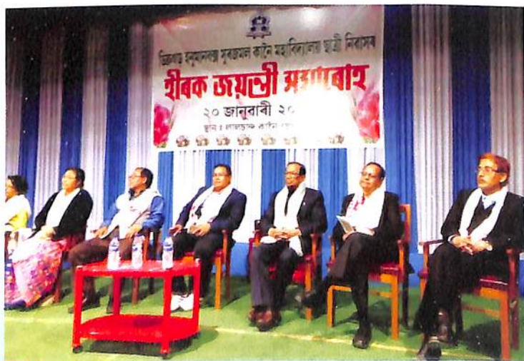
DHSK College Girls Hostel Diamond Jubilee Celebration 20.01.18