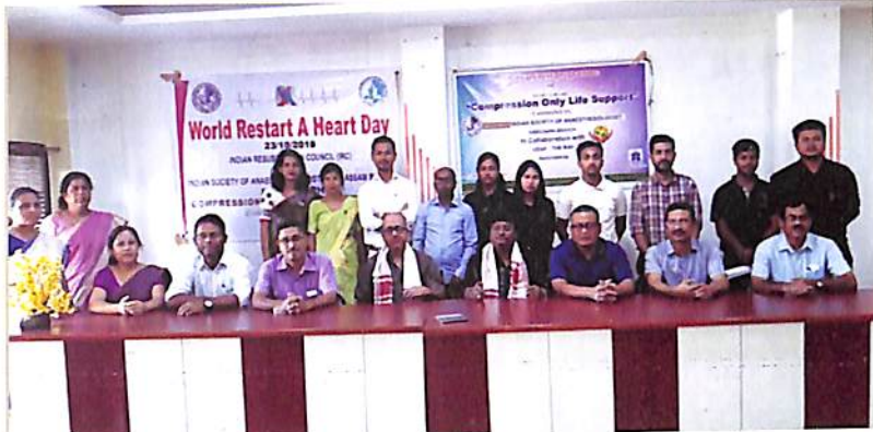
World Restart A Heart Day, 23.10.2018