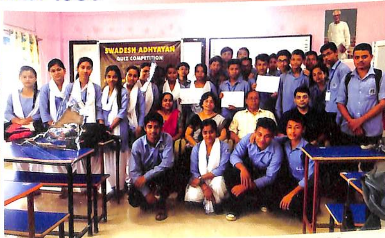
Swadesh Adhayan Quiz Competition- 08.09. 2018