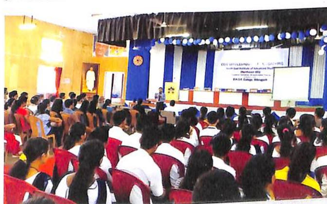
Civil Services Foundation Coaching July, 2018