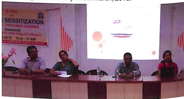
Gender Sensitization Programme 30.10.18