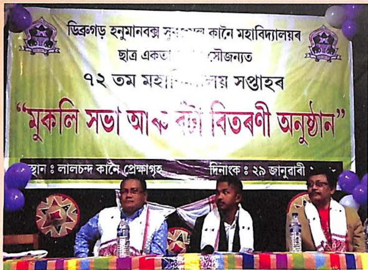
Prize Distribution of College Week 30.01.18