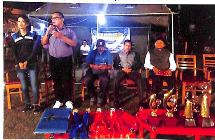
DU Inter College Kho Kho Competition, 2018