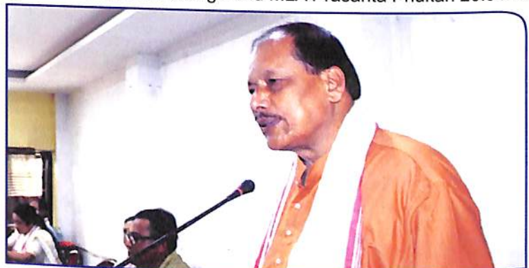
Meeting of the AHSEC, at DHSK College