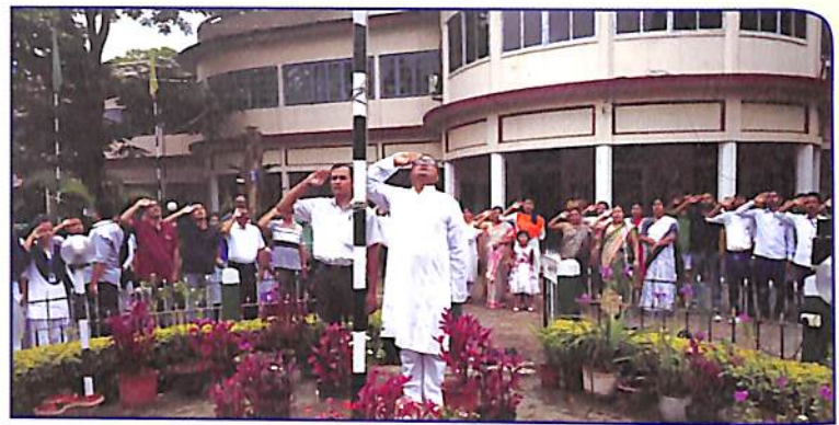
Independence Day, 2018