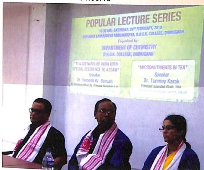
Popular Lecture Series organised by Department of Chemistry, 24.02.2018