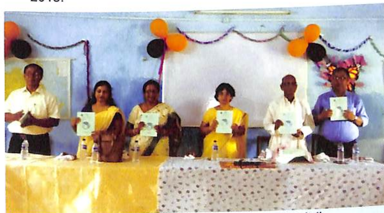
Release of Departmental Journal 'Dharitri'