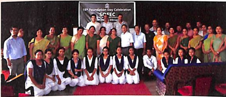
Foundation Day of SOFEC