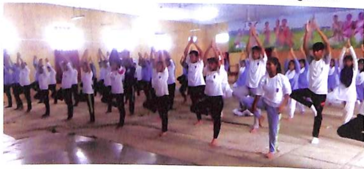
Celebration of International Yoga Day